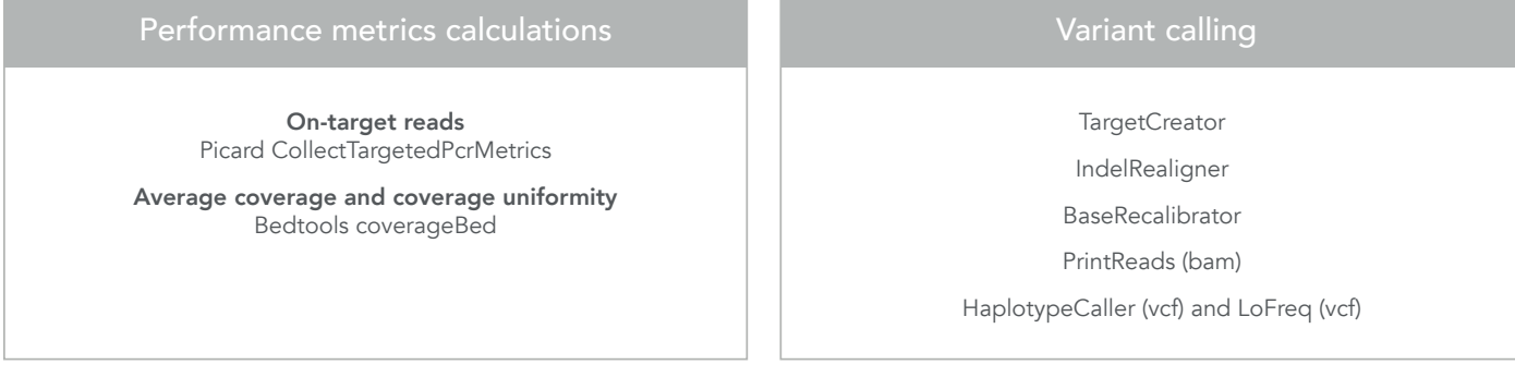
Figure 2. Suggested bioinformatics pipeline for xGen Amplicon Panels. Post-alignment soft clipping of primer sequences using the Primerclip tool (highlighted in dark blue) is a mandatory step when performing analysis on sequencing results from xGen Amplicon Panels. The other steps shown may be performed as listed, or a similar data analysis pipeline may be followed.